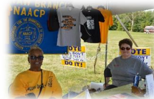
Side: Membership Drive at the African Cultural Festival