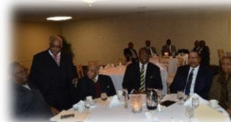
Side: Clergy Political Empowerment Brunch.