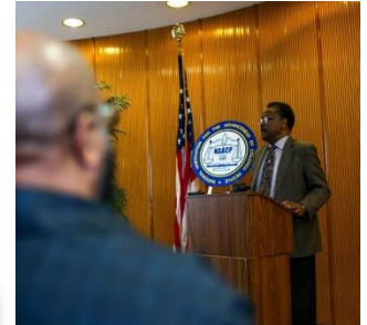
Top: NAACP hosts press conference to address issues with Saginaw School District