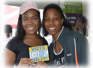
Top Left: Youth Council members participate at State NAACP Conference Top Right: Youth express support for voting