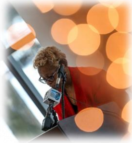
State of Community Address January 2018