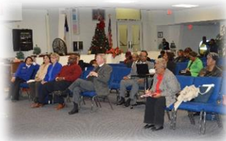
Upper: Delta College New Downtown Center Town Hall Meeting.