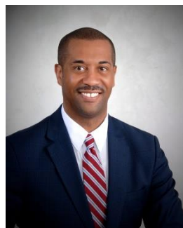
Honorable Manvel Trice III 70 th District Court Judge Saginaw County District Court